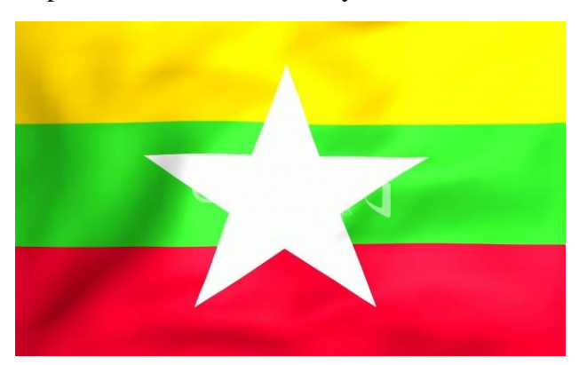
Republic of The Union of Myanmar

Myanmar Annual Fiscal Data Summary according to Myanmar Accounting Method and Myanmar Annual Fiscal Data according to IMF's Government Finance Statistics Analytical Method